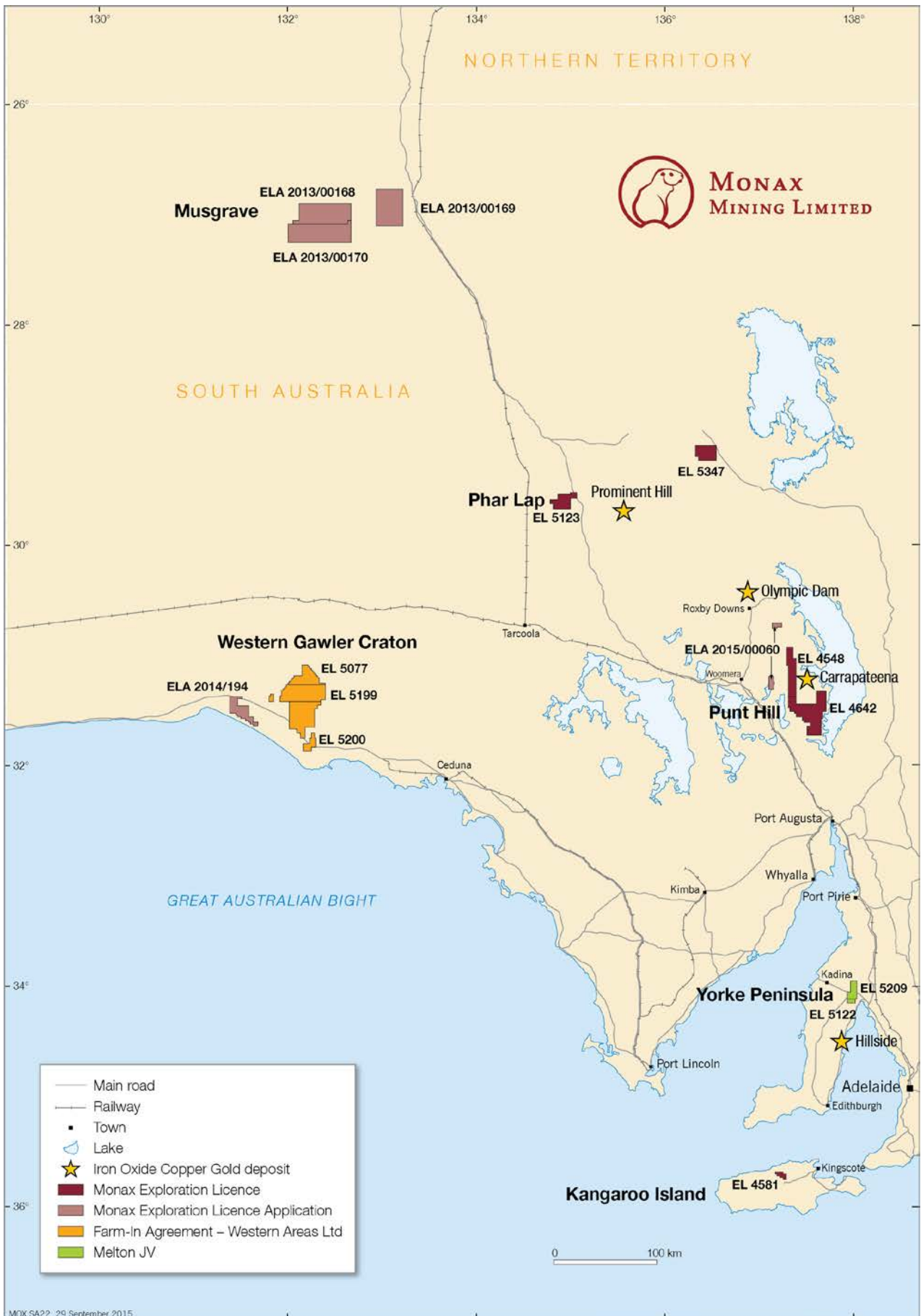
Figure 1. Location of Monax SA Projects including the Phar Lap Project.