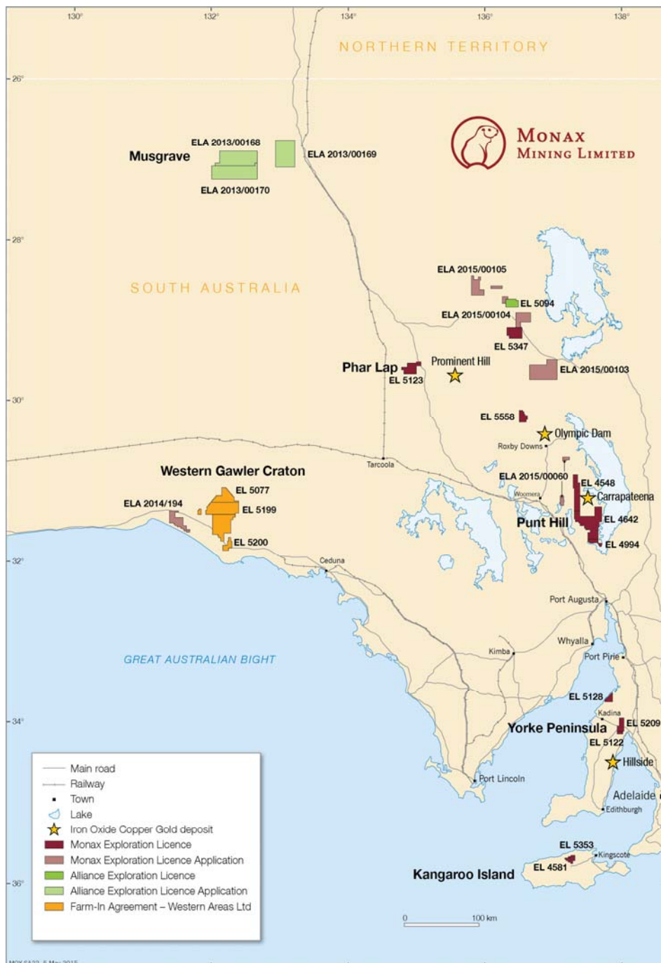
Figure 1. Location of Monax’s projects including Western Gawler Craton Project.